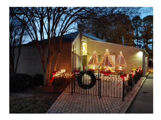
2020 Best Decorated Business Honorable Mention Sam T. Wilson Public Library December 2020