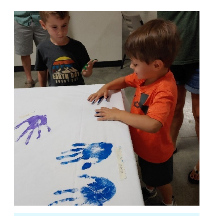
Summer Reading Program Kickoff June 2021 Handprint the Canvas