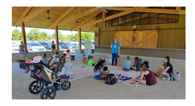
Storytime in the Park