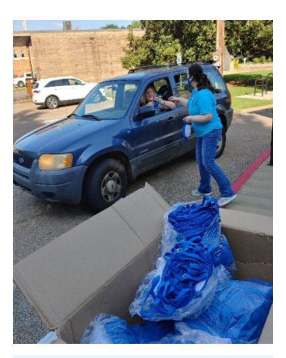
STWPL Staff & Student Volunteers Town of Arlington 'Mask Up' Thru August 2020

The 12 Days of Christmas Challenge was a fun way for the community to learn more about the Library. A different clue was posted at the Library and online during a 12 day period. Entries were turned in by the end of the month and the winner received a donated gift card to Crave Coffee Bar & Bistro, a popular local eatery!